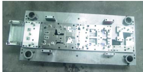
Tool Design & Build